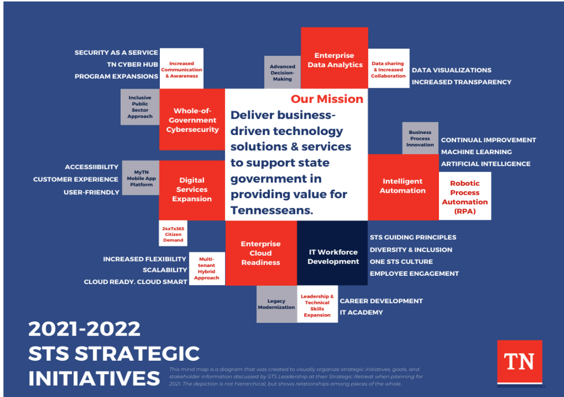
Figure C: STS Strategic Mind Map, 2021

This successful project implementation resulted in the conversion and retirement of a legacy platform, and the adoption of a fully upgraded contact center telephony platform which is secured in the Cloud. Both accomplishments align with STS Enterprise Strategic Initiatives (see Fig C).