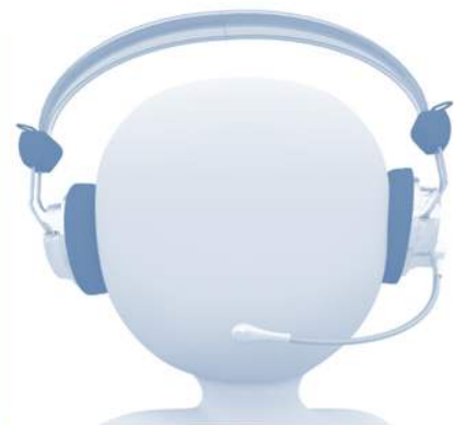
Fig A: TN DHS Call Center Volume