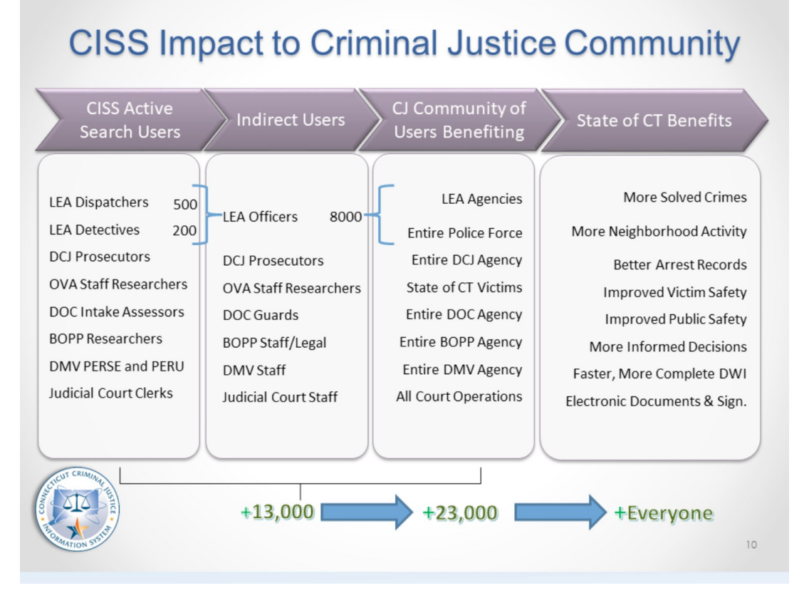
Figure 2.0 CISS Impact to State of Connecticut

CISS benefits to the Connecticut criminal justice agencies is shown in Figure 2.0. CISS will continue to be used as the preeminent information sharing system for CJI in Connecticut