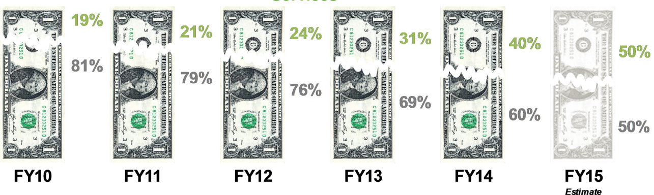
Ohio IT Spending: % IT Spending Infrastructure vs. New Applications and Services

Ohio has also experienced non-financial benefits through the Lines of Business approach. The LOB structure has facilitated communications, assisted in the development of strategies, increased adoption of shared solutions and changed the mindset to be more enterprise in nature. The LOBs have identified opportunities within their community of interest and have shared resources to support those opportunities.