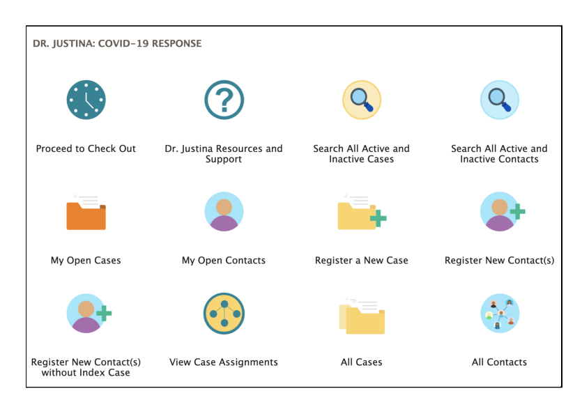
User interface for the Dr. Justina case investigation and contact tracing system

Vendors were invited to provide a test environment where their solution could be assessed based on functionality, user experience and technical fit. Stakeholders across the state participated directly in an interactive evaluation and selection process, which provided opportunities to assess vendors' work style and culture, center evaluation on user needs and generate buy-in from users. A human-centered approach was essential to ensure widespread use of the solution and to provide robust data for state-level decision-making on its case-investigation and contact-tracing efforts. Using this "demos not memos" process, a vendor was selected in just 19 days and $15 million under budget.