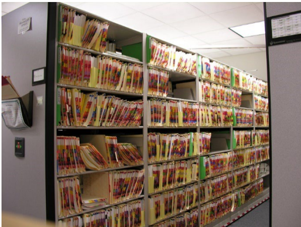
It took three years to convert more than one million records in rows and rows of library files into digital documents which are now available online in PA-SHARE.

An in-house scanning project using a high-capacity scanner was initiated to digitize all the PA SHPO's paper resource files which includes reports, PA Archaeological Site Survey, and PA Above Ground Survey records. All paper records, except reports, were digitized by PA SHPO staff. A contract team of six cultural resource experts was hired to work on this project. This team's primary duties included data entry of files into CRGIS, scanning paper files, and uploading electronic records to CRGIS for eventual migration into PA-SHARE. The consultants also performed a gap analysis between paper and electronic records, tracked down and addressed discrepancies, and entered missing information. This work was completed in June 2020 at a cost of just under $1 million.