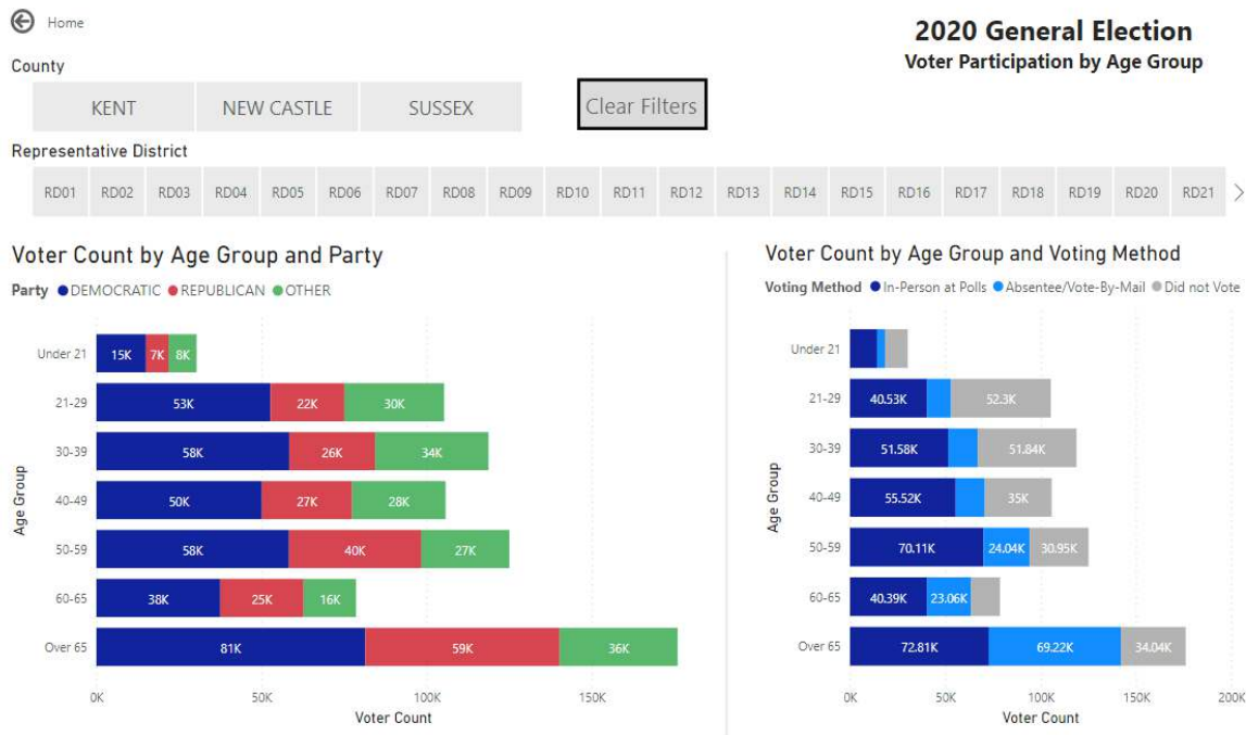
Figure 3: 2020 General Election Voter Participation by Age Group

The use of Microsoft Power BI, for the implementation of the election night reporting solution, has motivated the Department of Elections to look into other ways that they can create additional dashboards/visualizations that will give them greater insight into their own data. Figure 3, below, is a custom voter participation report that was created following the 2020 General Election.