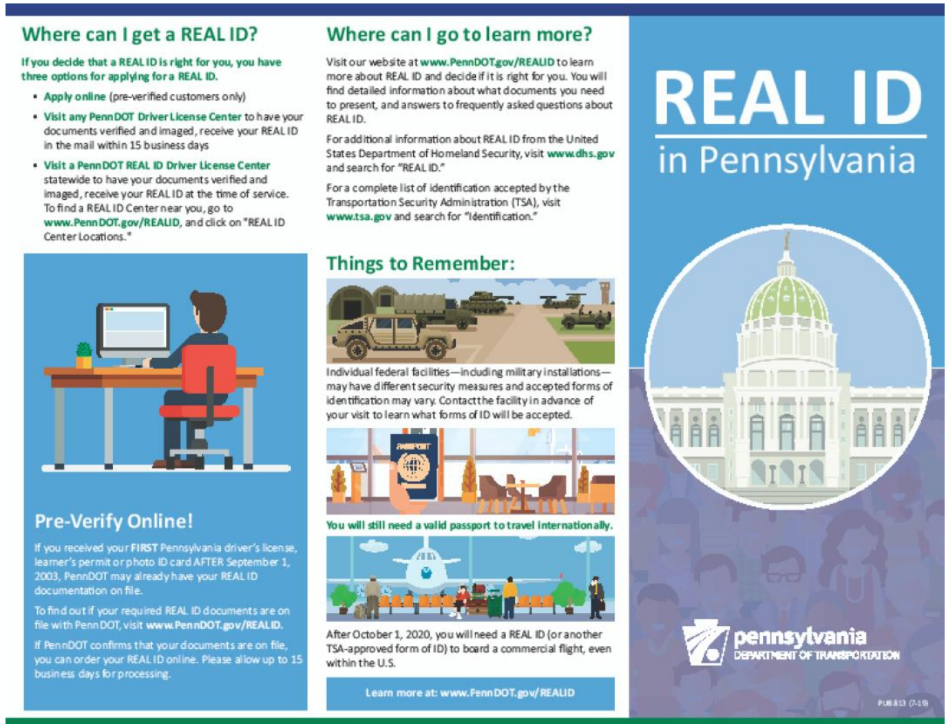
Figure 1: Customer tri-fold brochure about REAL ID.

Television and radio ads were created to notify Pennsylvanian's about REAL ID and additional information was made available at PennDOT's Driver and Vehicle Services website.