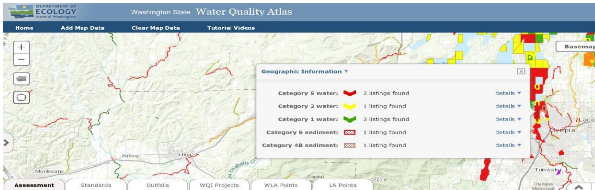
Figure 2 spatial representation of assessed surface waters and their assigned categories

allowing appropriate statewide Designated Uses, standards, and criteria to be related and applied to the assessable environmental results collected from EIM and WQP.