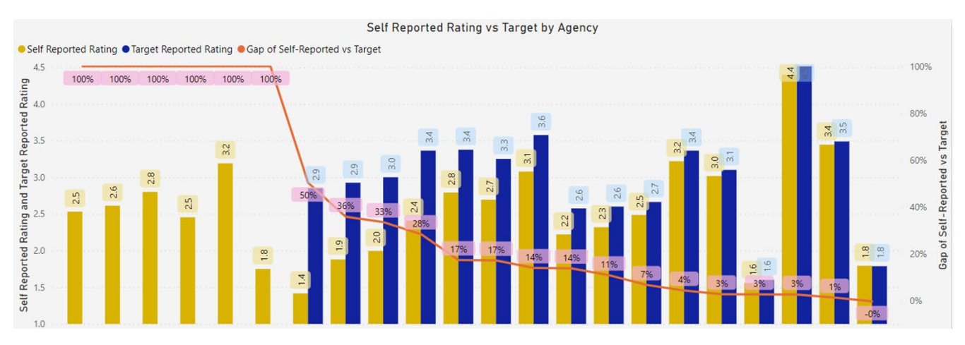
Baseline maturity assessment scores for each state agency (names removed for privacy). The gold bar represents the baseline score and the blue bar represents the target score for the 2022 reporting period.

To start implementation, the Office of Transformation and Strategy Delivery created and administered a largescale modernization maturity assessment survey to all executive branch agencies. This created a maturity baseline, measured against Minnesota's Modernization Playbook, from which state agencies set maturity targets and annual objectives.