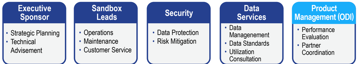
Figure 3 The CDT Sandbox Team

While CDT serves as the project lead, it acknowledges a need to collaborate with others on this leading-edge technology, realizing that working together beats working alone, it formed partnerships with other government organizations and academic institutions, including the White House, NASA, the City of San Jose, and the University of California Berkley.